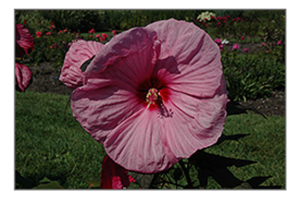
Dave Fleming Hibiscus flowers

Other Names: Rose Mallow, Hardy Hibiscus