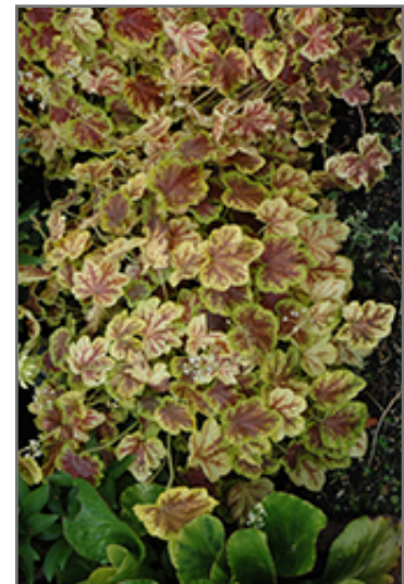
Solar Eclipse Foamy Bells