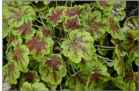
Solar Eclipse Foamy Bells foliage

Solar Eclipse Foamy Bells is recommended for the following landscape applications;