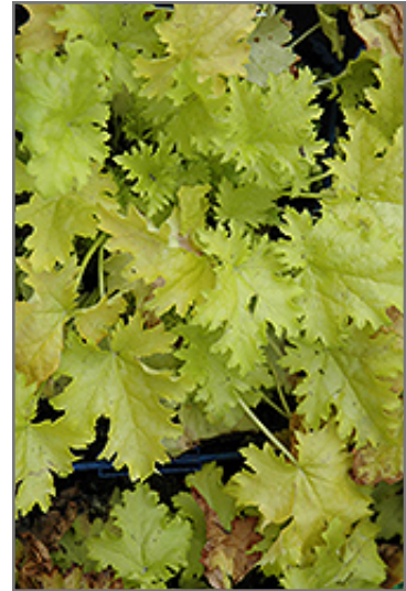
Pear Crisp Coral Bells foliage