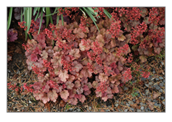
Cherry Cola Coral Bells in bloom

This is a relatively low maintenance plant, and should be cut back in late fall in preparation for winter. It is a good choice for attracting hummingbirds to your yard. It has no significant negative characteristics.