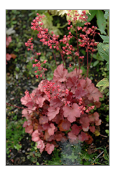
Cherry Cola Coral Bells

Cherry Cola Coral Bells is recommended for the following landscape applications;