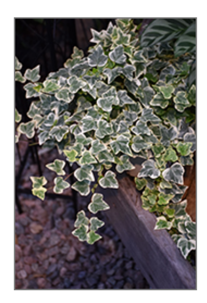
Glacier Ivy foliage