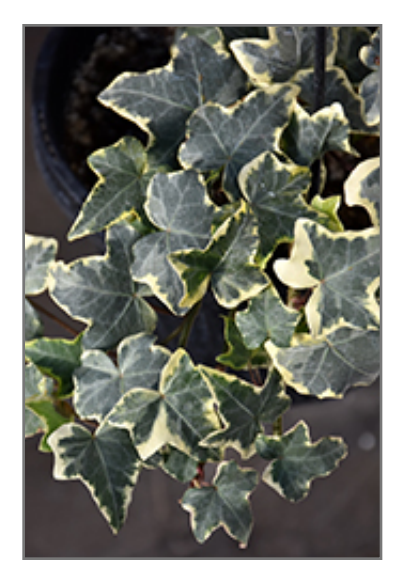
Glacier Ivy foliage