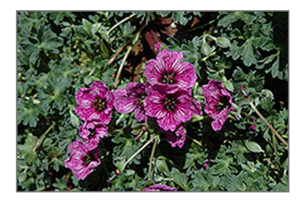
Laurence Flatman Cranesbill flowers