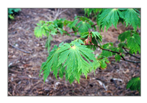
Fullmoon Maple foliage

A shapely, neat and tidy small accent tree, the ideal size for the home landscape, interesting in all seasons with delicately-shaped foliage, blazing fall colors and colorful stems