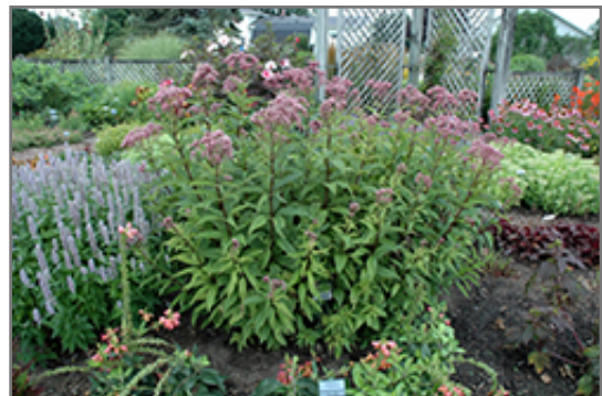
Baby Joe Dwarf Joe Pye Weed in bloom