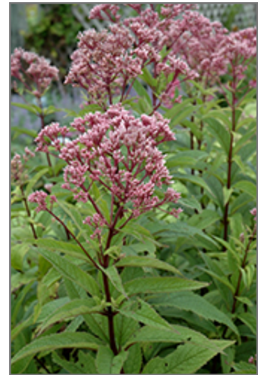
Baby Joe Dwarf Joe Pye Weed flowers

This is a relatively low maintenance plant, and is best cleaned up in early spring before it resumes active growth for the season. It is a good choice for attracting butterflies to your yard, but is not particularly attractive to deer who tend to leave it alone in favor of tastier treats. It has no significant negative characteristics.