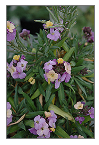
Poem Pastel Wallflower flowers

Poem Pastel Wallflower is recommended for the following landscape applications;