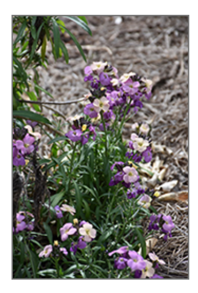
Poem Pastel Wallflower flowers