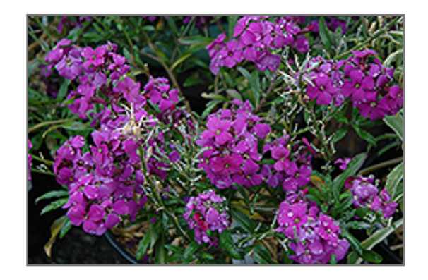
Poem Lilac Wallflower flowers