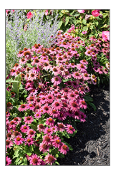
PowWow Wild Berry Coneflower in bloom

PowWow Wild Berry Coneflower is a fine choice for the garden, but it is also a good selection for planting in outdoor pots and containers. With its upright habit of growth, it is best suited for use as a 'thriller' in the 'spiller-thriller-filler' container combination; plant it near the center of the pot, surrounded by smaller plants and those that spill over the edges. Note that when growing plants in outdoor containers and baskets, they may require more frequent waterings than they would in the yard or garden. Be aware that in our climate, most plants cannot be expected to survive the winter if left in containers outdoors, and this plant is no exception. Contact our experts for more information on how to protect it over the winter months.