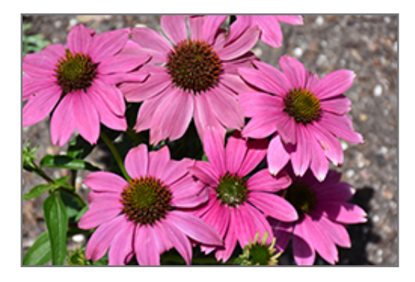
PowWow Wild Berry Coneflower flowers