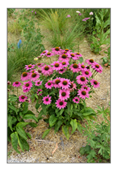
PowWow Wild Berry Coneflower in bloom

This is a relatively low maintenance plant, and is best cleaned up in early spring before it resumes active growth for the season. It is a good choice for attracting birds and butterflies to your yard, but is not particularly attractive to deer who tend to leave it alone in favor of tastier treats. It has no significant negative characteristics.