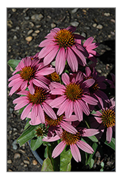
Mistral Coneflower flowers