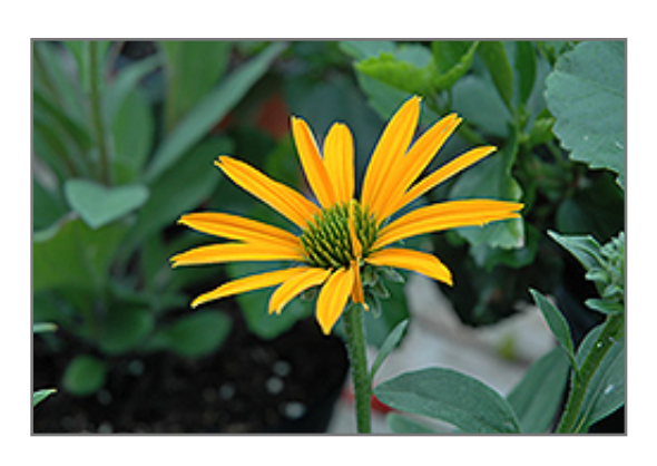
Now Cheesier Coneflower flowers

Giant daisy-like flowers are a deep golden-yellow with chartreuse-orange center cones; fragrant blooms make long-lasting cutflowers, attracts pollinators and feeds the birds in winter; use in naturalized areas