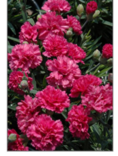
Early Bird Sherbet Pinks flowers

Plant Height: 4 inches Flower Height: 6 inches Spread: 8 inches Spacing: 6 inches Sunlight: O Hardiness Zone: 5a Other Names: Border Pinks, Cheddar Pinks Group/Class: Early Bird Series