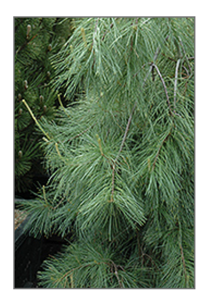
Weeping White Pine foliage