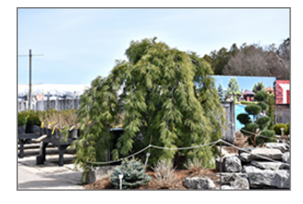
Weeping White Pine

A weeping and trailing shrub or small tree, very unlike the species; features soft blue needles, tends to crawl along the ground and over rocks or walls, or forms a small weeping accent plant if trained on a standard; beautiful if properly grown