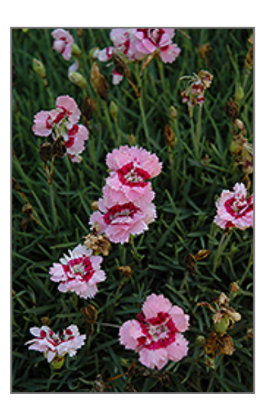
Heart's Desire Pinks flowers

Stunning pink double flowers with hot pink centers rise above mounds of fine foliage; great for flower arrangements; deadhead to rebloom; very floriferous with a tidy, uniform habit; sturdy, resilient and easy to grow; excellent in containers