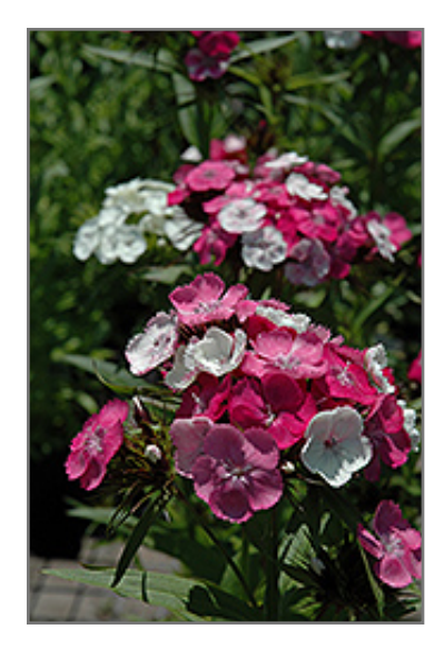
Harlequin Sweet William flowers

Deliciously clove-scented, velvety frilly flowers emerge white and mature to red; optimal site has full sun with ample moisture; amend clay soils for best growth; seeds freely but divide for truest color