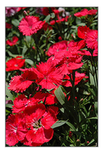
Elation Coral Pinks flowers

Elation Coral Pinks is recommended for the following landscape applications;