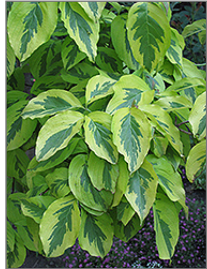
Cherokee Sunset Flowering Dogwood foliage

Cherokee Sunset Flowering Dogwood is recommended for the following landscape applications;