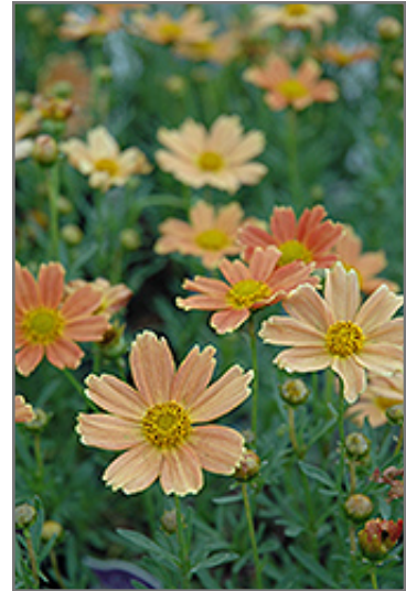
Sienna Sunset Tickseed flowers

Sienna Sunset Tickseed is recommended for the following landscape applications;