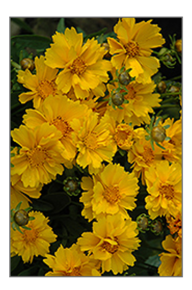
Presto Dwarf Tickseed flowers