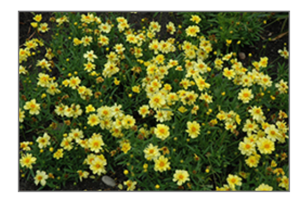
Galaxy Tickseed in bloom

Galaxy Tickseed is recommended for the following landscape applications;