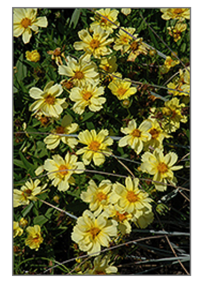
Galaxy Tickseed flowers

This is a relatively low maintenance plant, and is best cleaned up in early spring before it resumes active growth for the season. It is a good choice for attracting butterflies to your yard, but is not particularly attractive to deer who tend to leave it alone in favor of tastier treats. It has no significant negative characteristics.