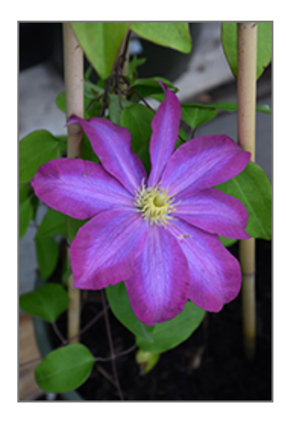
Pink Champagne Clematis flowers

Pink Champagne Clematis features showy hot pink star-shaped flowers with lavender overtones and creamy white anthers at the ends of the branches from late spring to late summer. It has green deciduous foliage. The compound leaves do not develop any appreciable fall colour.