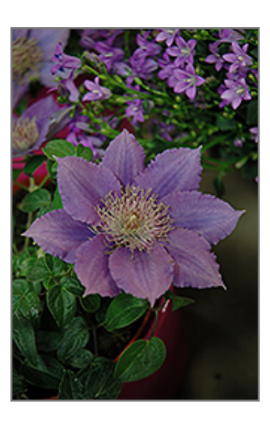
Bijou Clematis flowers

Bijou Clematis features delicate violet star-shaped flowers with blue overtones and white eyes at the ends of the branches from early to late summer. It has green deciduous foliage. The compound leaves do not develop any appreciable fall colour.