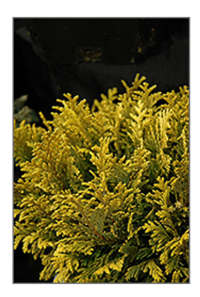
Goldilocks Falsecypress foliage

Goldilocks Falsecypress will grow to be about 30 feet tall at maturity, with a spread of 20 feet. It has a low canopy, and should not be planted underneath power lines. It grows at a slow rate, and under ideal conditions can be expected to live for 60 years or more.