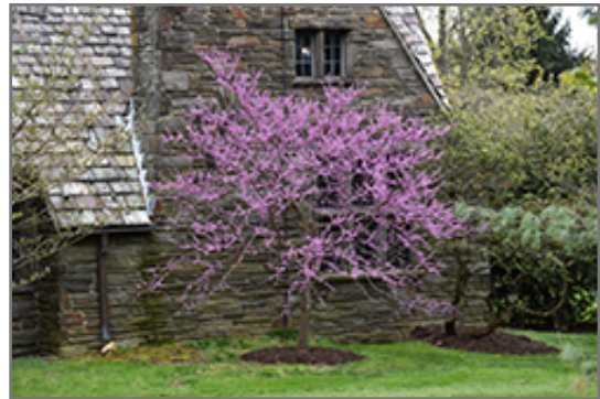
Burgundy Hearts Redbud in bloom