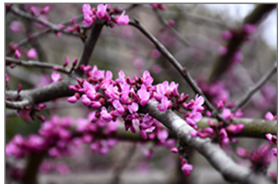
Burgundy Hearts Redbud flowers