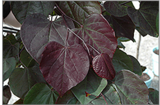
Burgundy Hearts Redbud foliage

Burgundy Hearts Redbud will grow to be about 25 feet tall at maturity, with a spread of 30 feet. It has a low canopy with a typical clearance of 3 feet from the ground, and is suitable for planting under power lines. It grows at a medium rate, and under ideal conditions can be expected to live for 60 years or more.