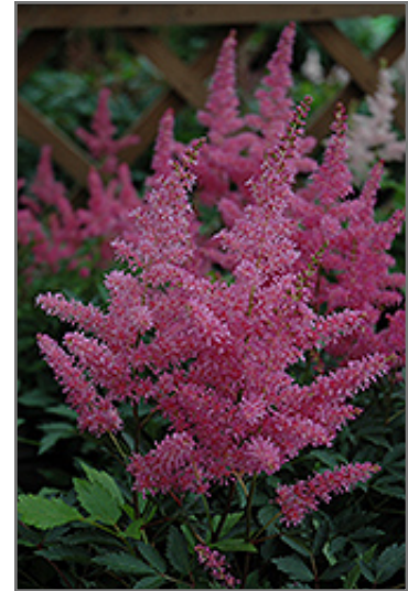
Younique Lilac Astilbe flowers