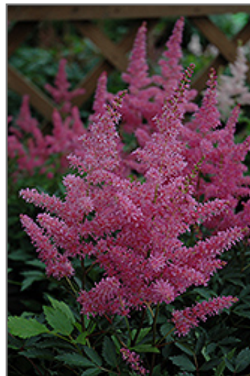
Younique Lilac Astilbe flowers