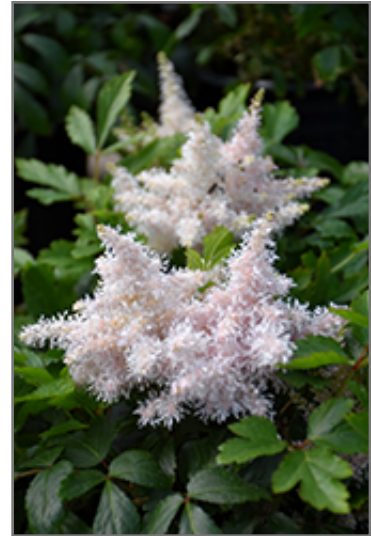
Sugarberry Astilbe flowers