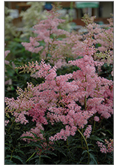
Drum And Bass Astilbe flowers

Striking bright pink plumes rising above large bright green leaves; perfect in a shady spot with dappled light; prefers moisture so water regularly for abundant flowers and nice foliage