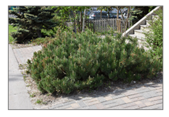
Dwarf Mugo Pine

Dwarf Mugo Pine is a dense multi-stemmed evergreen shrub with a more or less rounded form. Its relatively fine texture sets it apart from other landscape plants with less refined foliage.