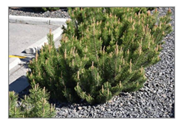
Dwarf Mugo Pine

This is a relatively low maintenance shrub. When pruning is necessary, it is recommended to only trim back the new growth of the current season, other than to remove any dieback. It has no significant negative characteristics.