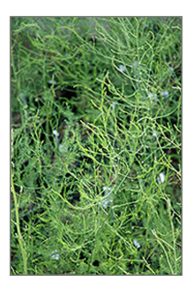
Jersey Jewel Asparagus foliage

This plant is typically grown in a designated vegetable garden. It does best in full sun to partial shade. It does best in average to evenly moist conditions, but will not tolerate standing water. It is not particular as to soil pH, but grows best in rich soils. It is somewhat tolerant of urban pollution. This particular variety is an interspecific hybrid.