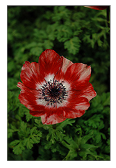
Harmony Scarlet Anemone flowers

This variety forms a dense clump of ferny foliage in spring, then produces striking scarlet red poppy-like flowers on tall stems that sway in the breeze; very pretty when massed in the garden or along borders