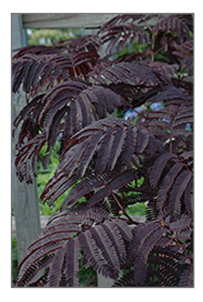
Summer Chocolate Mimosa foliage

This tree will require occasional maintenance and upkeep, and should only be pruned after flowering to avoid removing any of the current season's flowers. Gardeners should be aware of the following characteristic(s) that may warrant special consideration;