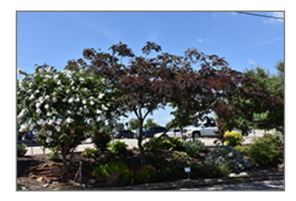
Summer Chocolate Mimosa