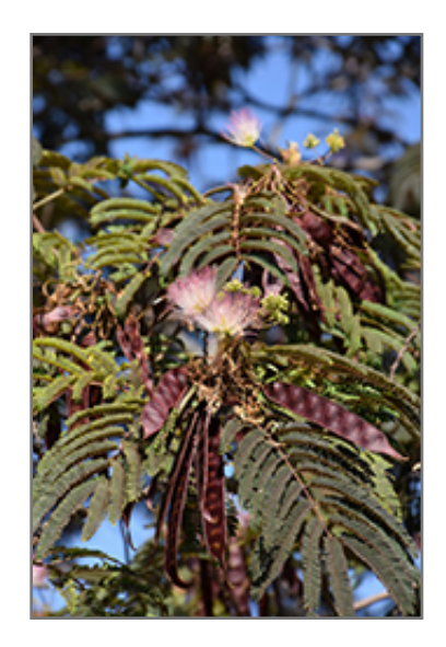
Summer Chocolate Mimosa flowers

This tree should only be grown in full sunlight. It is very adaptable to both dry and moist growing conditions, but will not tolerate any standing water. It is not particular as to soil type or pH, and is able to handle environmental salt. It is highly tolerant of urban pollution and will even thrive in inner city environments. This is a selected variety of a species not originally from North America.