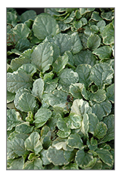
Tapestry Bugleweed foliage

A beautiful low-growing ground cover that forms a dense mat of gray, light green and white-mottled foliage that really catches the eye; smallish spikes of light purple flowers add interest in spring, makes a good filler for moist shady areas of the garden