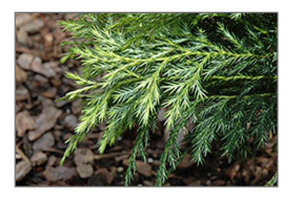
Golden Vietnamese Cypress foliage

Golden Vietnamese Cypress will grow to be about 45 feet tall at maturity, with a spread of 30 feet. It has a low canopy with a typical clearance of 1 foot from the ground, and should not be planted underneath power lines. It grows at a fast rate, and under ideal conditions can be expected to live to a ripe old age of 100 years or more; think of this as a heritage tree for future generations!