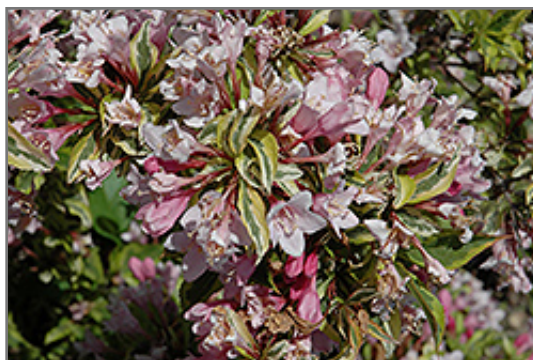
Rainbow Sensation Weigela flowers

Rainbow Sensation Weigela is recommended for the following landscape applications;