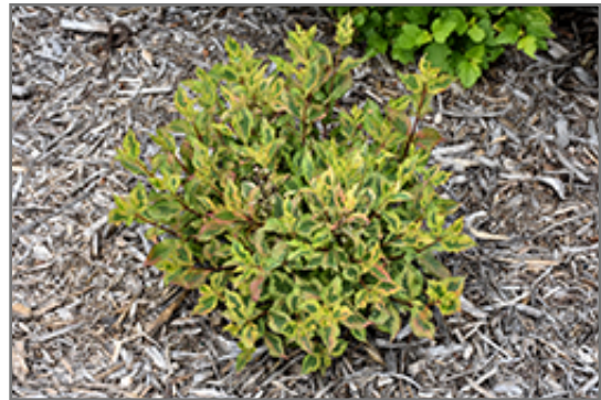
Rainbow Sensation Weigela

Rainbow Sensation Weigela makes a fine choice for the outdoor landscape, but it is also well-suited for use in outdoor pots and containers. Because of its height, it is often used as a 'thriller' in the 'spiller-thriller-filler' container combination; plant it near the center of the pot, surrounded by smaller plants and those that spill over the edges. It is even sizeable enough that it can be grown alone in a suitable container. Note that when grown in a container, it may not perform exactly as indicated on the tag - this is to be expected. Also note that when growing plants in outdoor containers and baskets, they may require more frequent waterings than they would in the yard or garden. Be aware that in our climate, most plants cannot be expected to survive the winter if left in containers outdoors, and this plant is no exception. Contact our experts for more information on how to protect it over the winter months.