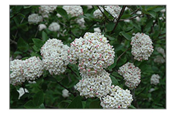
Fragrant Viburnum (tree form) flowers