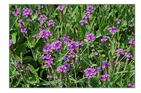
Polaris Verbena flowers

Plant Height: 18 inches Flower Height: 24 inches Spread: 12 inches Spacing: 8 inches Sunlight: O Hardiness Zone: 6a