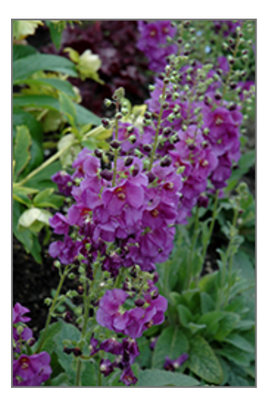
Sugar Plum Mullein flowers

A compact variety with short, well branched spikes of violet-purple blooms with dark purple anthers, rising from a tight rosette of green leaves; the smaller size makes it perfect for containers; deadheading encourages new blooms