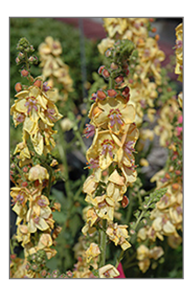
Clementine Mullein flowers

A tall variety with long, graceful spikes of peach blooms with fuzzy plum rose stamens, rising from a mound of large green leaves; perfect for borders and containers; deadheading encourages new blooms