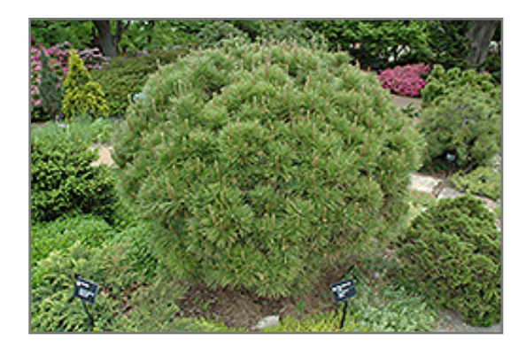
Globe Japanese Red Pine

An interesting evergreen garden shrub with a dense, mounded habit of growth, compact and slow growing, eventually becoming a large ball; excellent for form, texture and color detail in home landscape gardens