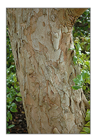
Water Gum bark

Water Gum is recommended for the following landscape applications;