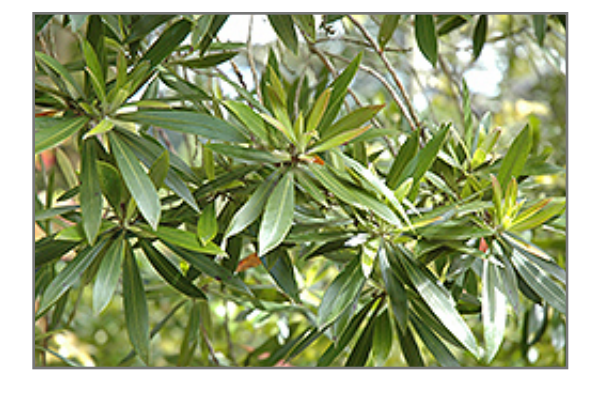
Water Gum foliage

A slow growing sturdy tree with a widely spreading canopy; bright yellow flower clusters in summer have what some may consider an unpleasant odor; excellent for street planting and shade; leaves may turn red in colder weather