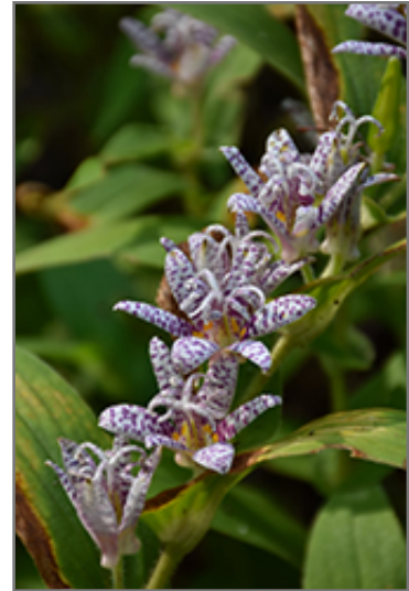
Toad Lily flowers