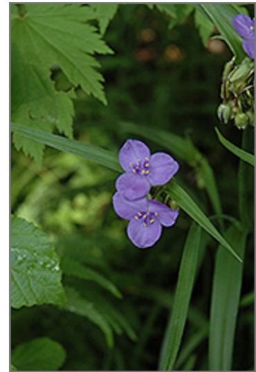
Virginia Spiderwort flowers

Virginia Spiderwort is recommended for the following landscape applications;