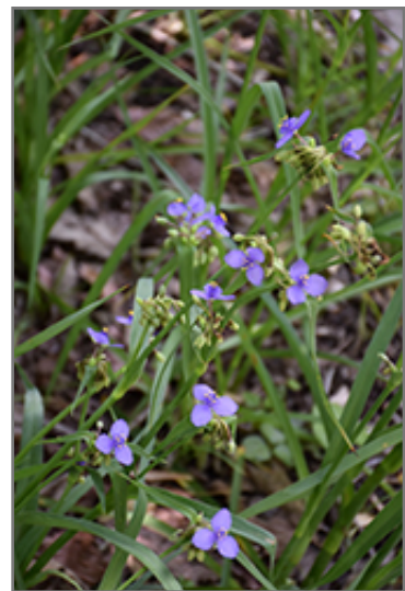
Virginia Spiderwort flowers