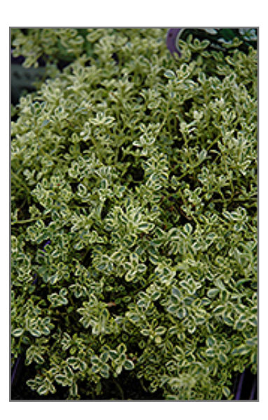
Highland Cream Creeping Thyme

A highly desirable and popular groundcover, forming a dense low mat completely covered in lovely pink flowers throughout summer; attractive, variegated fragrant foliage the rest of the season; needs a dry and sunny location, can take light foot traffic