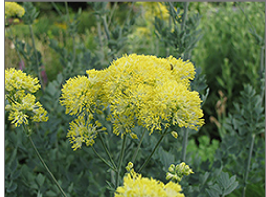
Yellow Meadow Rue flowers

This is a relatively low maintenance plant, and should be cut back in late fall in preparation for winter. It is a good choice for attracting bees and butterflies to your yard, but is not particularly attractive to deer who tend to leave it alone in favor of tastier treats. It has no significant negative characteristics.