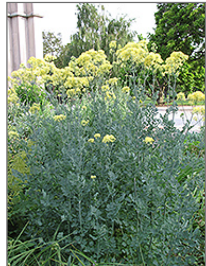
Yellow Meadow Rue in bloom