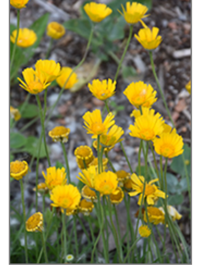
Angelita Daisy flowers

Cheery little bright-yellow rebloomer, perfect for xeriscapes, alpine and rock gardens; resistant to critters and attracts butterflies; also known as Thrift-leaf Perky Sue, Four-Nerve Daisy, and Slender-stem Bitterweed