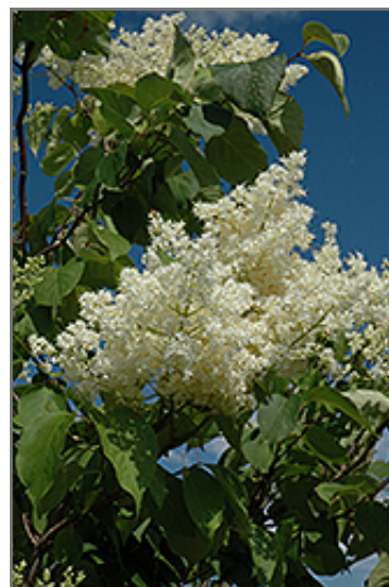
Ivory Silk Tree Lilac (tree form) flowers