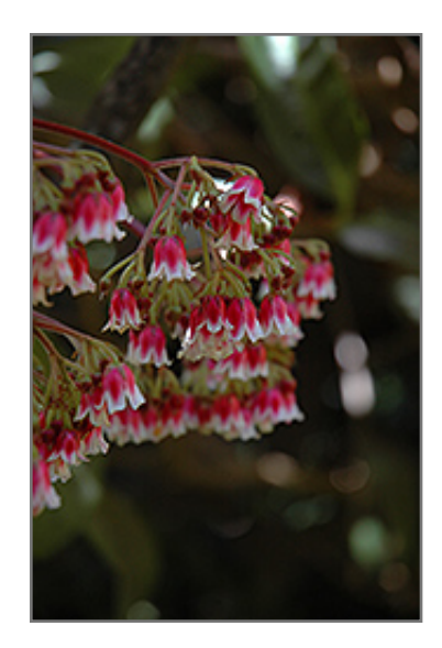
Coralberry Tree flowers