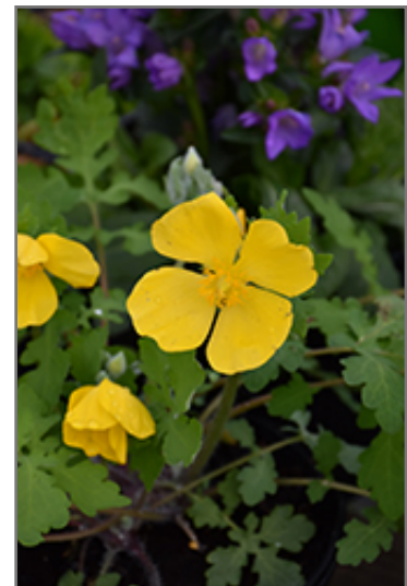
Celandine Poppy flowers