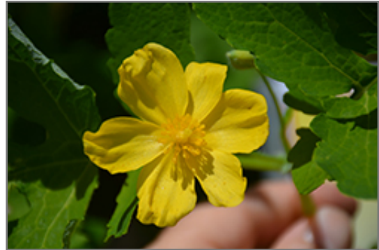
Celandine Poppy flowers

Celandine Poppy is recommended for the following landscape applications;